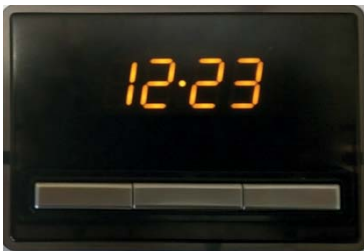
Large Frame, keyboard integrated

» The product is a monolithic electronic control integrated in plastic housing. It allows to manage time. The User Interface is made by Led display available in different colors and mechanical switches. The output is a power relay. Two sizes of housing are possible. An intergrated keyboard with 3 buttons is also available on the large frame.